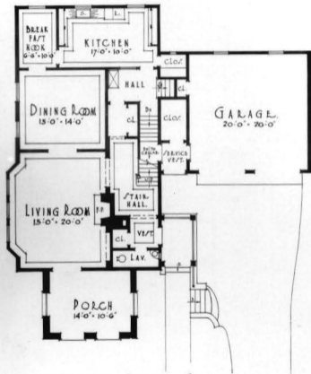
' FIRST FLOOR PLAN '