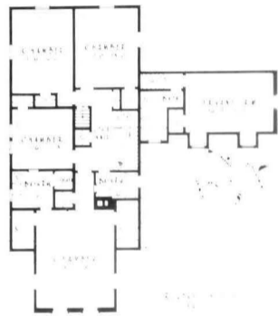
REAR FLOOR PLAN